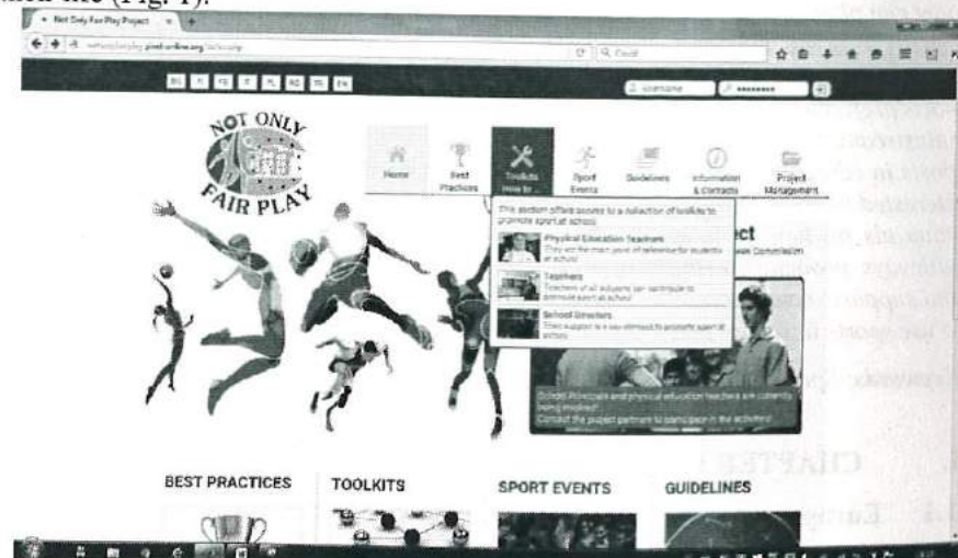
Figure 1 Section of the project website

The project has produced a collection of best practice for sport promotion which encourages curricular and extracurricular school initiatives (e.g. sport competitions among schools, school sports days etc.), experiences and projects supporting mutual understanding among cultures, socialization among students, values and ethics etc. (e.g. use of sport as universal language to stimulate interaction between students from different ethnic/cultural groups), experiences which promote sport as an incentive to increase students' motivation to learn and stay at school, success stories of students that have managed to balance their school duties with their passion for sport and succeeded in organizing their time and their life (Fig. 1).